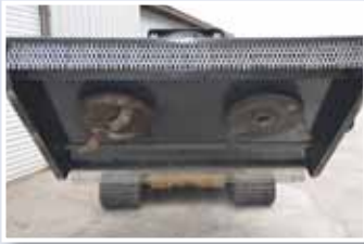
Twin HD 3/4" Blade Disc with 1/2" thick Cling Blade